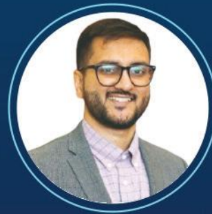
Faisal Nawaz Al-Amal Hospital (UAE)