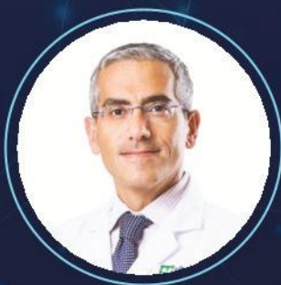
Naim Aoun American Hospital Dubai (UAE)